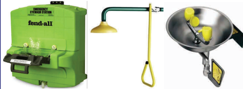
Portable Eyewashes Deluge Showers Plumbed Eyewashes