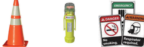
Traffic Cones LED Flares OSHA Safety Signs