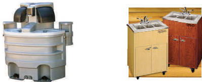
Portable Handwash Portable NSF Sinks