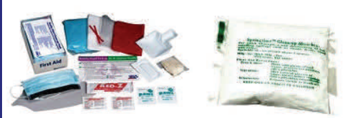
Bloodborne Pathogen Kits Clean Up Absorbent