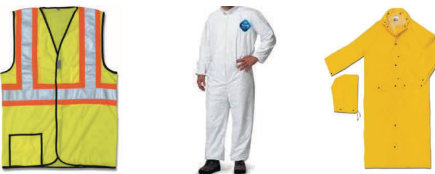
Safety Vest & Shirts Disposable Coveralls FR Clothing