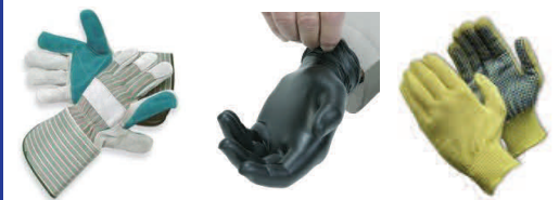
Leather Gloves, Nitrile & Latex Gloves, Cut Resistant Gloves