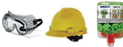
Glasses & Goggles Hard Hats & Caps Ear Plugs/Ear Muffs