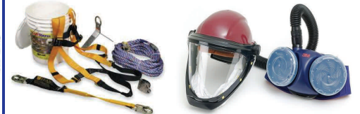
Harnesses, Lanyards & Kits Full Face Respirators, Face Masks