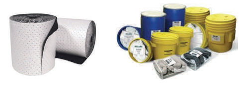
Rolled Sorbents Spill Kits & Spill Containment