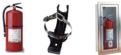
Fire Extinguishers Fire Extinguisher Brackets & Cabinets