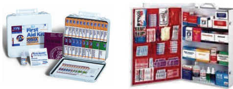
ANSI Kits/Bulk Kits 2, 3 & 4 Shelf Stations